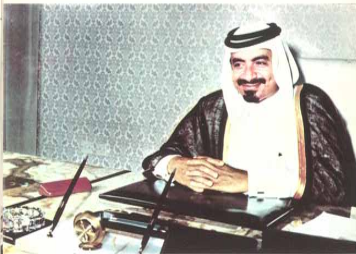
HIS HIGHNESS SHEIKH KHALIFEH BEN HAMAD AL - THANI