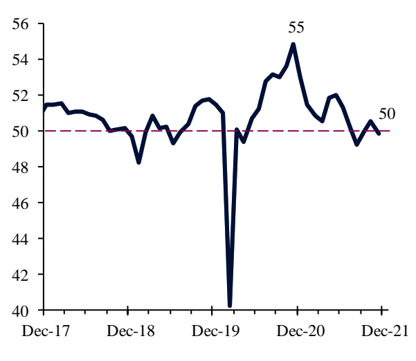
Chart 1: China manufacturing PMI (50 = threshold separating contraction from expansion)

reading of 50 serves as a threshold to separate contractionary (below 50) from expansionary (above 50) changes in business conditions. In other words, higher frequency data is indicating that China activity is closing-in to contraction territory.