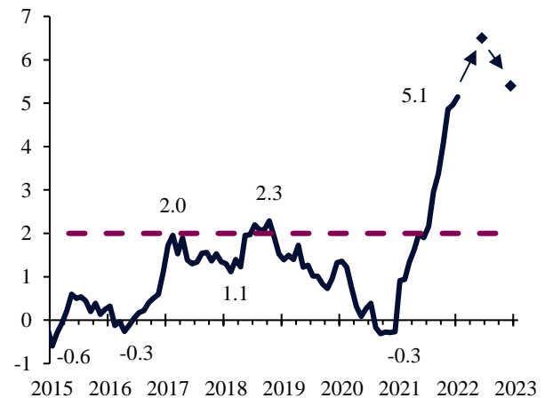
Chart 2: European inflation (Percent change, year-on-year)

First, energy prices have surged as the conflict has escalated, with European gas prices up by over 75% from mid-February (Chart 1). Given low inventories and import constraints, we expect gas prices to