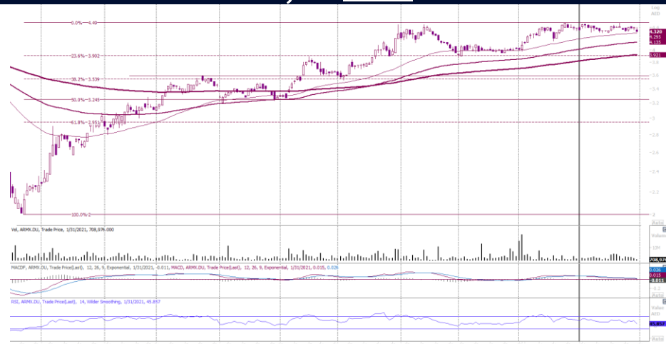
Aramex PJSC – DAILY CHART

The Index did not correct as we expected and remains with its uptrend. The RSI, however, remains to be negatively divergent against the price's movement. Thus, we should keep stops tight and use dips to capitalize on corrections.