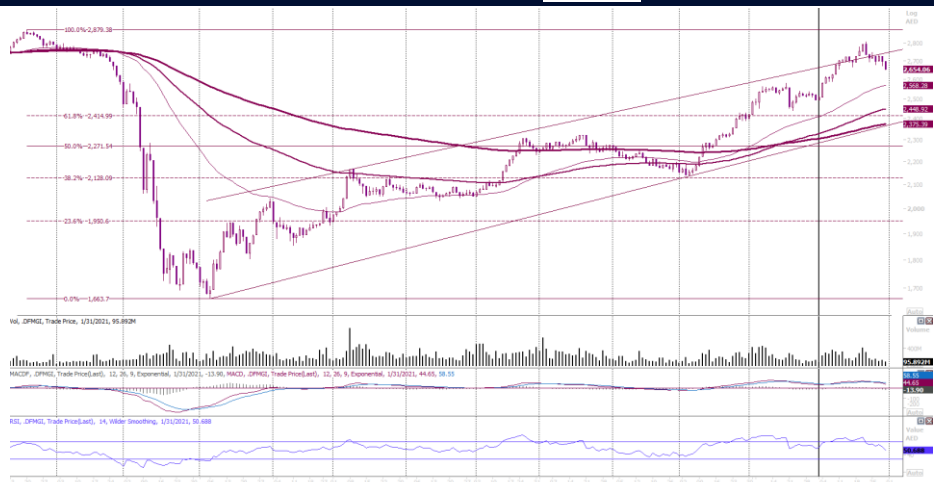
DFM GENERAL INDEX – DAILY CHART