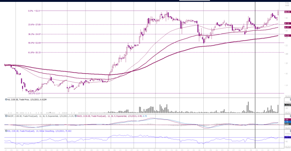
National Co. for Glass Ind. – DAILY CHART

The Index moved above the 8,800 critical resistance level and, despite expected volatility, is expected to continue with its path north.