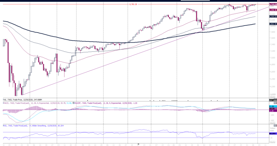
TADAWUL ALL-SHARE INDEX – DAILY CHART