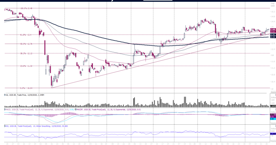
Bank Aljazira – DAILY CHART

The trend has been up, but we are seeing negative divergence between the Index and the RSI's move. The mentioned divergence suggests a possible correction from here.