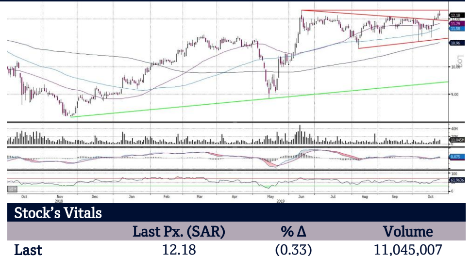
DAR AL ARKAN REAL ESTATE DEV – DAILY CHART

The index is now in a downtrend, expect weakness to continue.