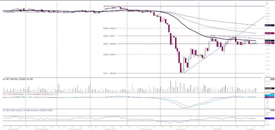
ADX GENERAL INDEX - DAILY CHART