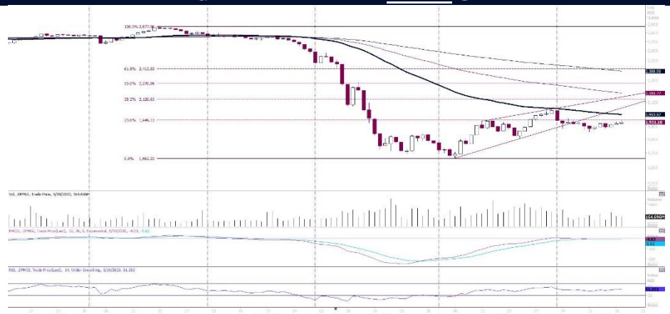
DFM GENERAL INDEX – DAILY CHART