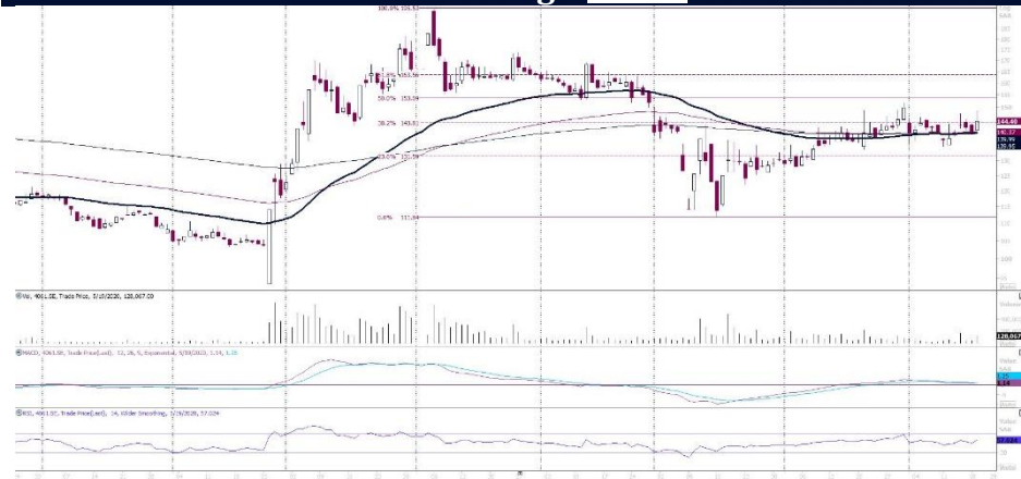
Anaam Intl. Holding - DAILY CHART

The Index failed to stay above the 50SMA and retreated under selling pressure.