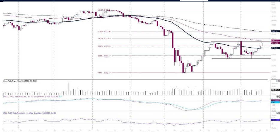
TADAWUL ALL-SHARE INDEX - DAILY CHART