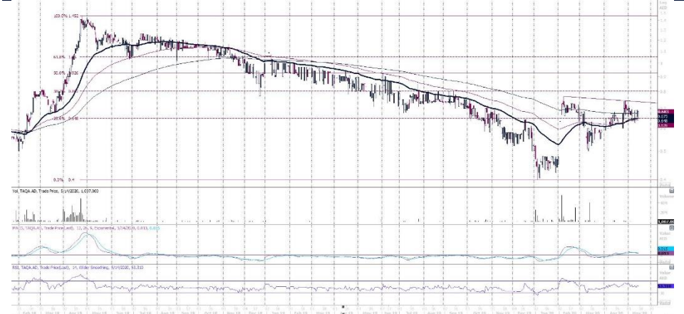
Abu Dhabi National Energy Co. - DAILY CHART

The Index weakened as we expected; it also broke below a significant support. Expect further decline.