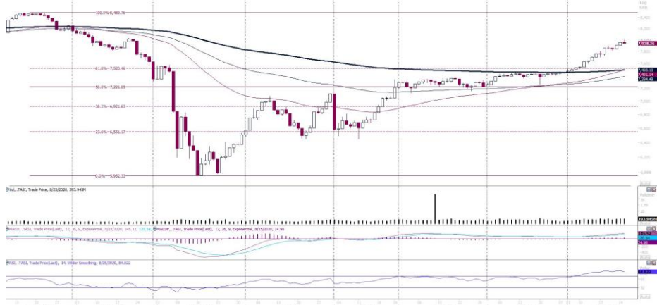
TADAWUL ALL-SHARE INDEX - DAILY CHART