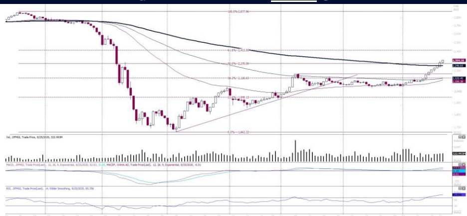
DFM GENERAL INDEX - DAILY CHART