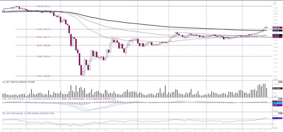
ADX GENERAL INDEX - DAILY CHART