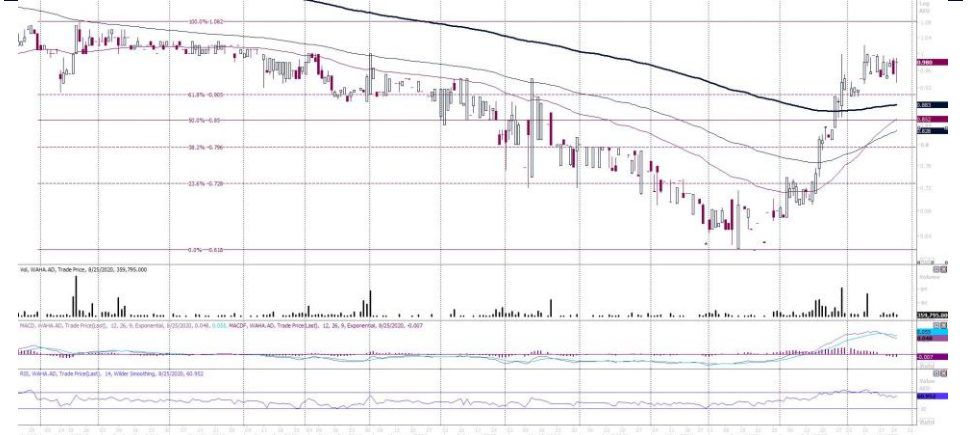
Al Waha Capital - DAILY CHART

We may see weakness from the current levels as the index stabilized for over a month.