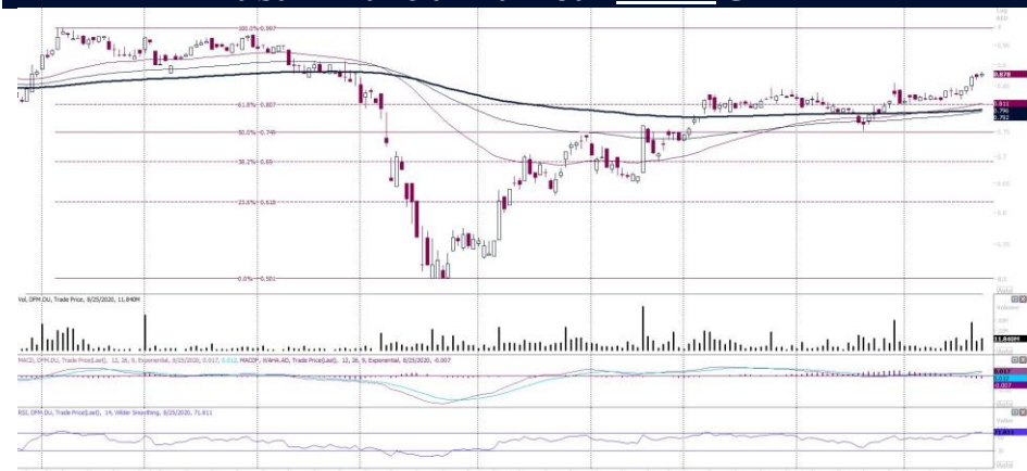
Dubai Financial Market - DAILY CHART

The Index remains to be stable below the 200MA but the recent uptick could continue in the short term.