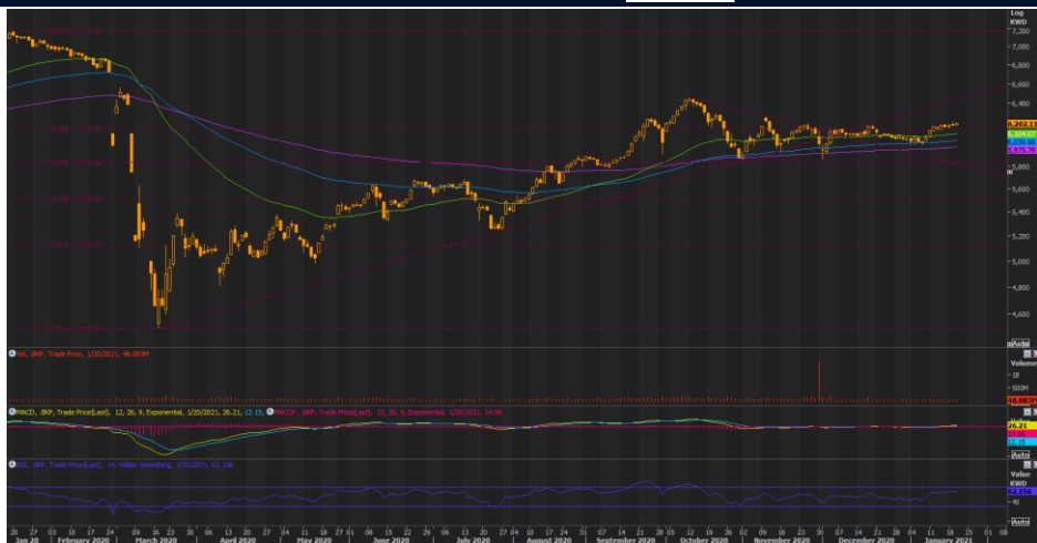
KWSE PREMIER MARKET – DAILY CHART