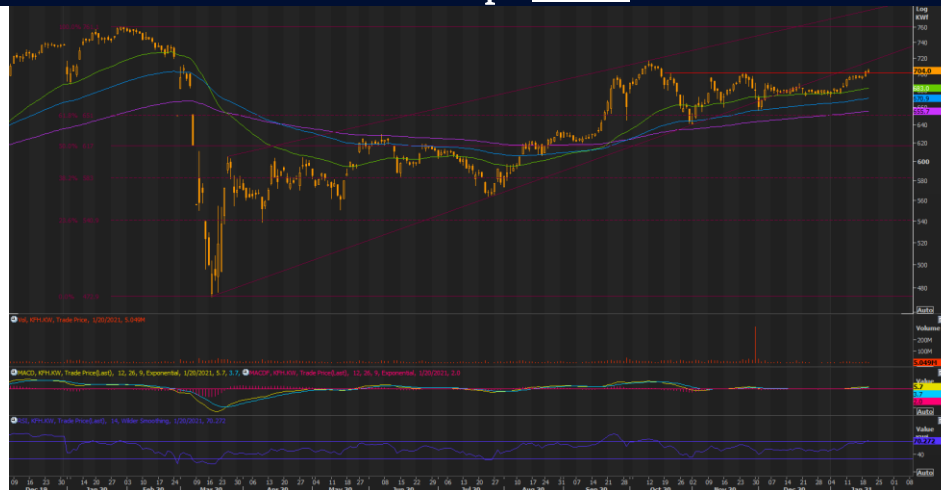
GFH Financial Group – DAILY CHART

The Index remains flat and we await a move upwards as the Index respected its moving averages support levels, thus far.