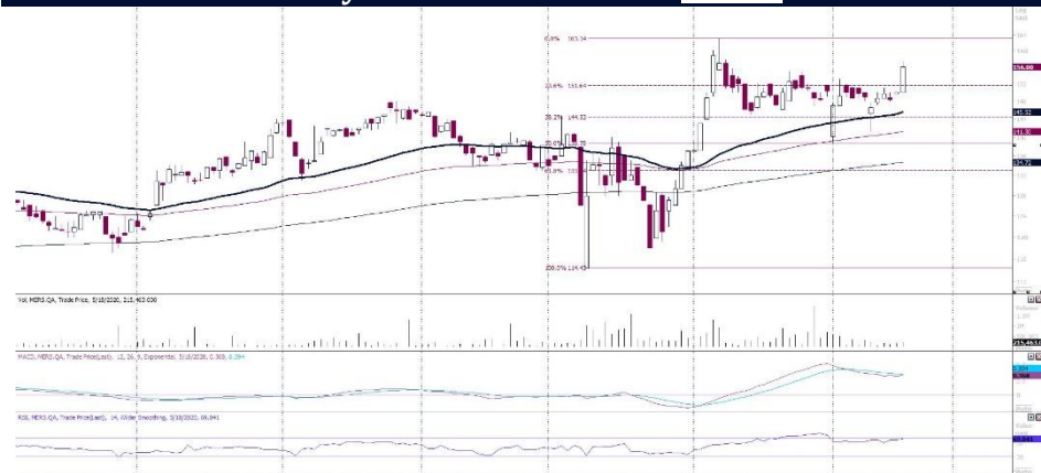
Saudia Dairy and Foodstuff Co. - DAILY CHART

The Index failed to stay above the 50SMA and retreated under selling pressure.