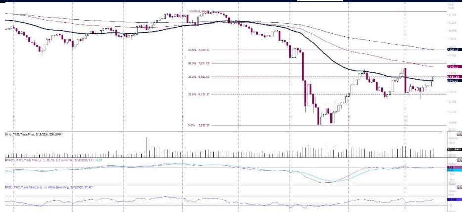
TADAWUL ALL-SHARE INDEX - DAILY CHART