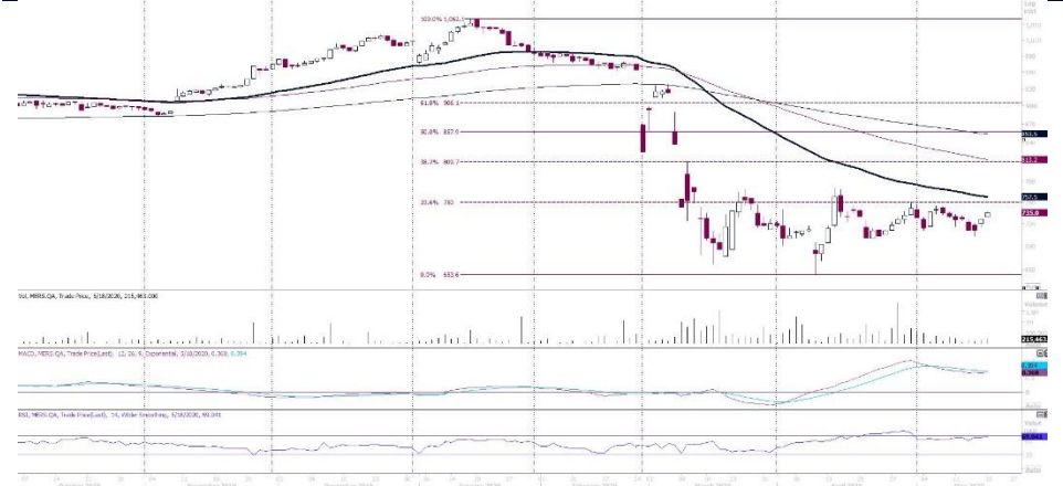
National Bank of Kuwait - DAILY CHART

The Index has created a bullish flag formation, suggesting the uptick could continue against the downtrend in the short term.