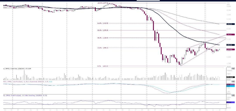
DFM GENERAL INDEX – DAILY CHART