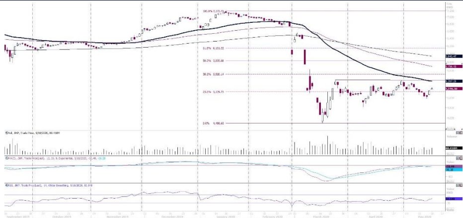
KWSE PREMIER MARKET - DAILY CHART