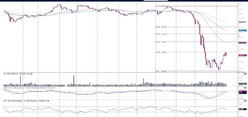
DFM GENERAL INDEX – DAILY CHART