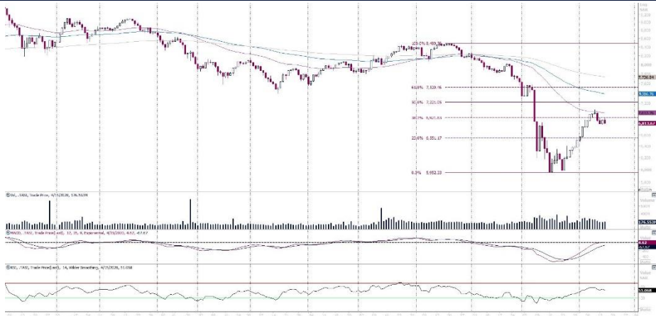
TADAWUL ALL-SHARE INDEX - DAILY CHART