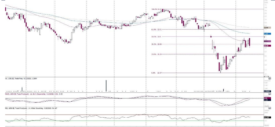
Banque Saudi Fransi - DAILY CHART

The Index reached the 50SMA, we may see weakness to unfold around here.