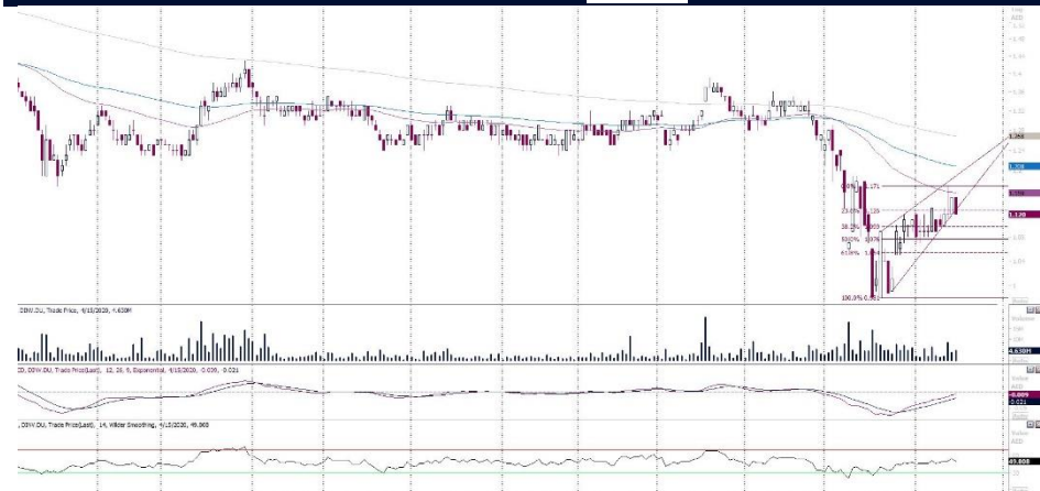
Dubai Investments – DAILY CHART

The trend remains down, and the Index reached multi-year levels. However, indicators show extreme levels have been reached.