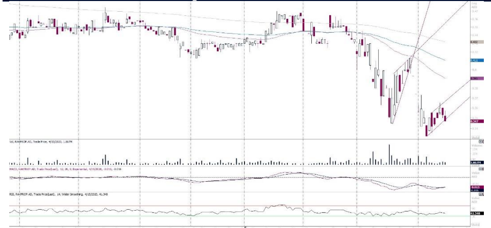
RAK Properties - DAILY CHART

The Index reached the 50SMA, we may see weakness to unfold around here.