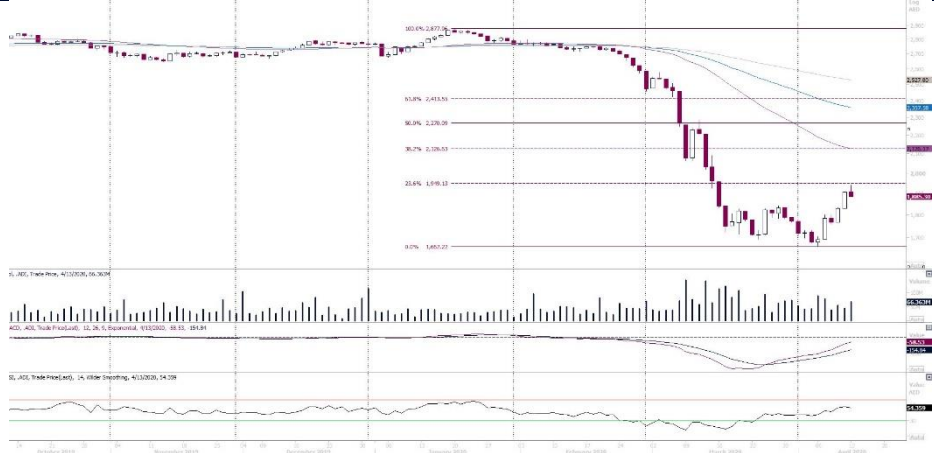
DFM GENERAL INDEX – DAILY CHART