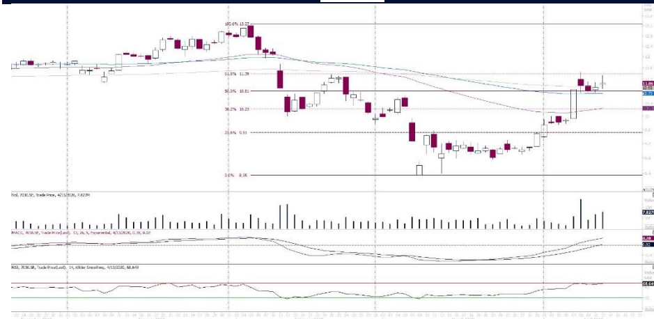
Zain KSA - DAILY CHART

The Index reached the 50SMA, we may see weakness to unfold around here.