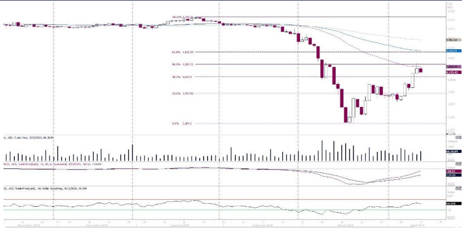
ADX GENERAL INDEX – DAILY CHART