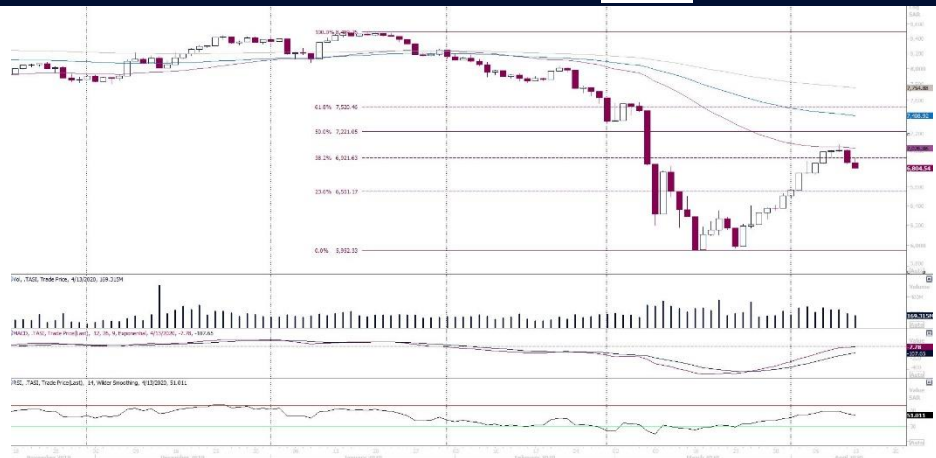
TADAWUL ALL-SHARE INDEX - DAILY CHART