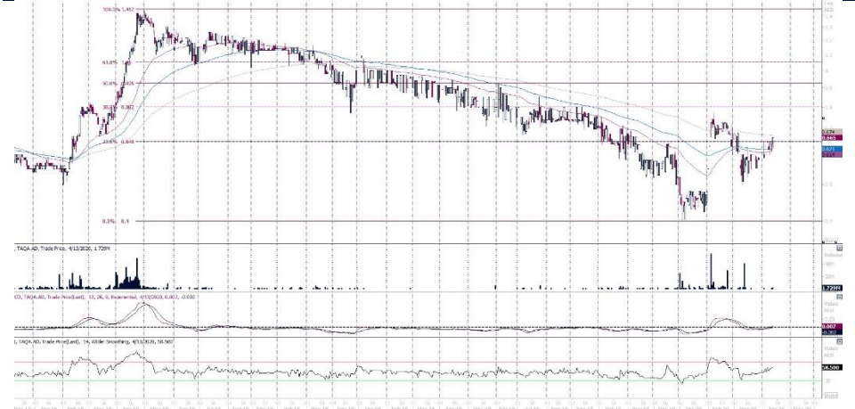
Abu Dhabi National Energy Co. – DAILY CHART

The Index reached the 50SMA, we may see weakness to unfold around here.