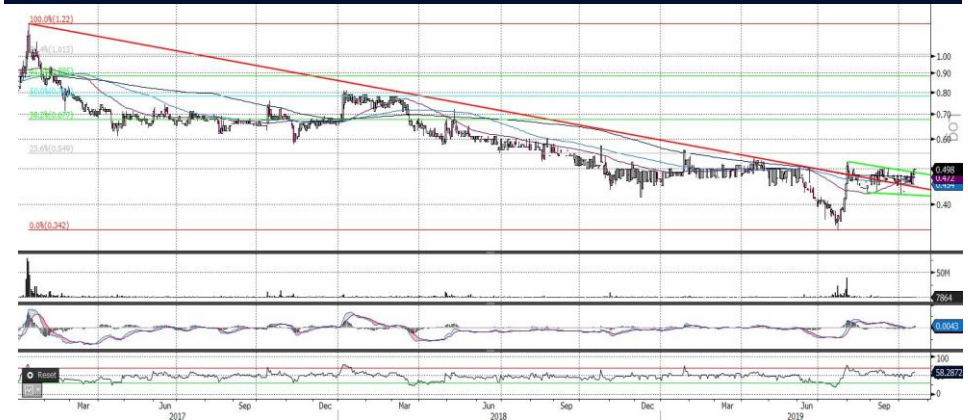
ARKAN BUILDING MATERIALS CO – DAILY CHART

The Index may move higher above its moving averages after it moves above the 5,150 mark.