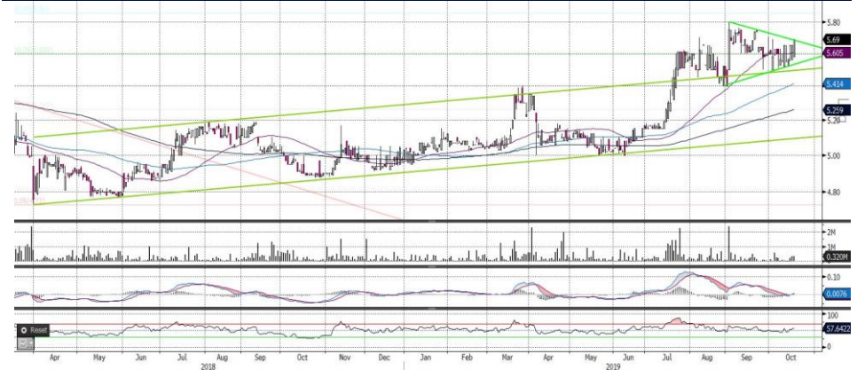
EMIRATES INTEGRATED TELECOMM – DAILY CHART

The Index bounced off its moving averages' support level; we may see a correction against the uptrend.