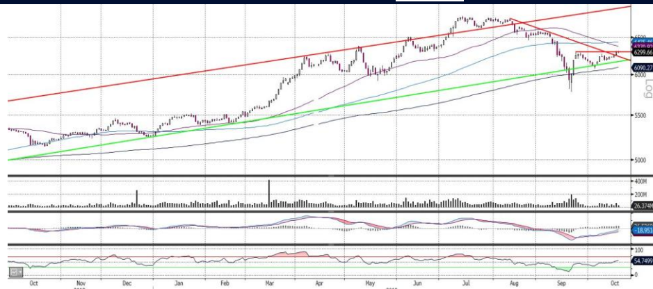
KWSE PREMIER MARKET – DAILY CHART