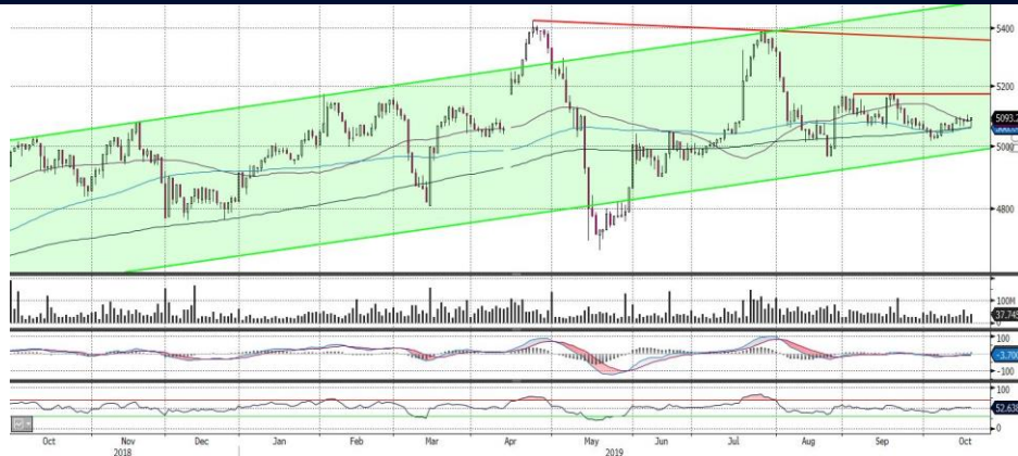
ADX GENERAL INDEX – DAILY CHART