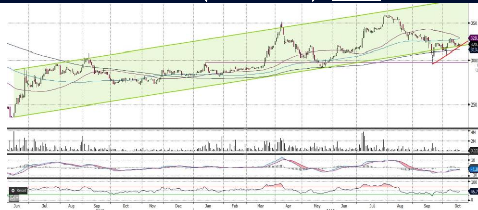
AHLI UNITED BANK (ALMUTAHED) – DAILY CHART

The Index is expected to bounce off the current levels and will be testing the 200SMA support level.