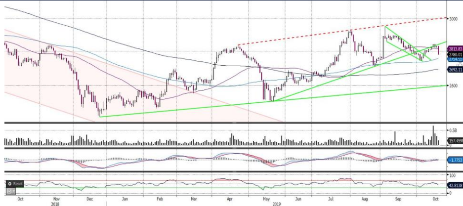
DFM GENERAL INDEX – DAILY CHART