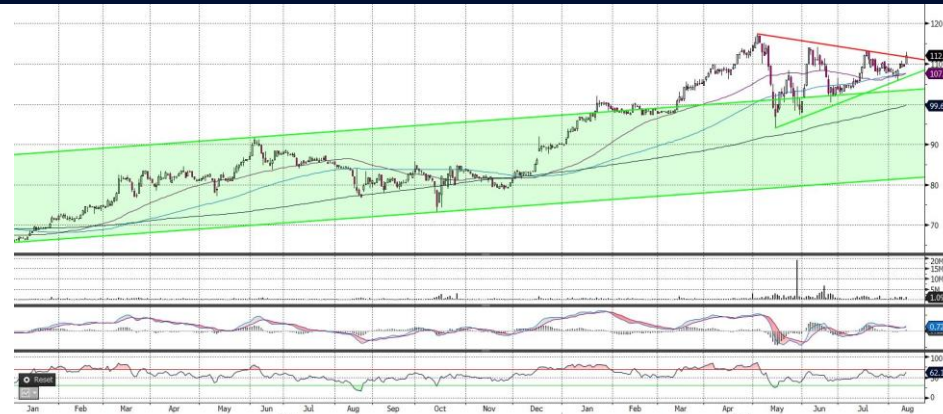
SAUDI TELECOM CO – DAILY CHART

The Index is testing its 200SMA support level; failure to hold around that support means further decline is expected.