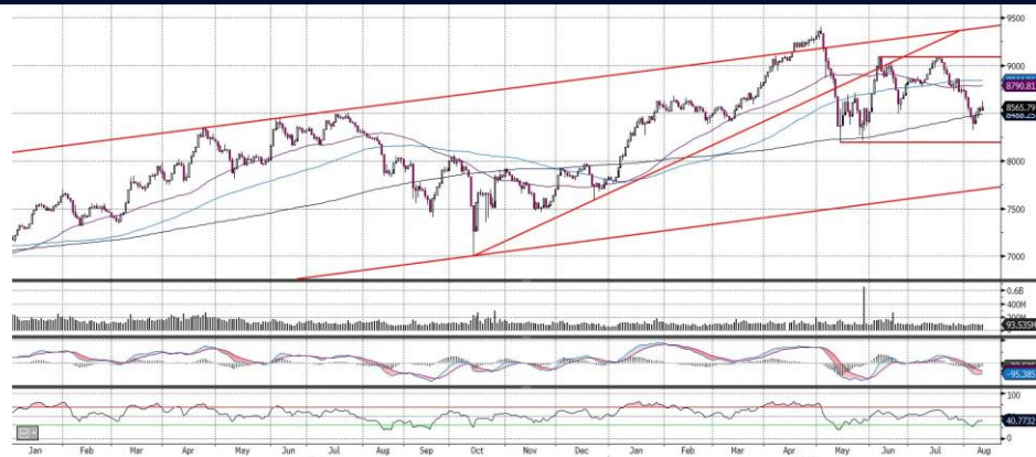
TADAWUL ALL-SHARE INDEX – DAILY CHART