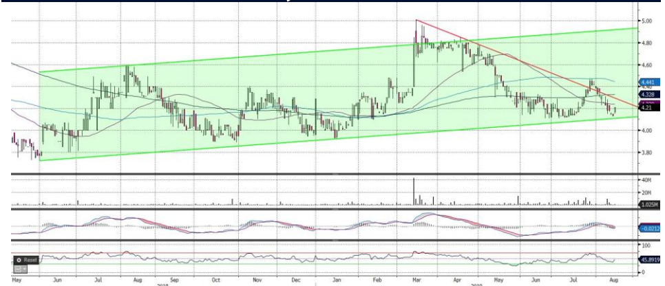
ARAMEX PJSC – DAILY CHART

The Index has moved up as expected and now is in a possible corrective phase.