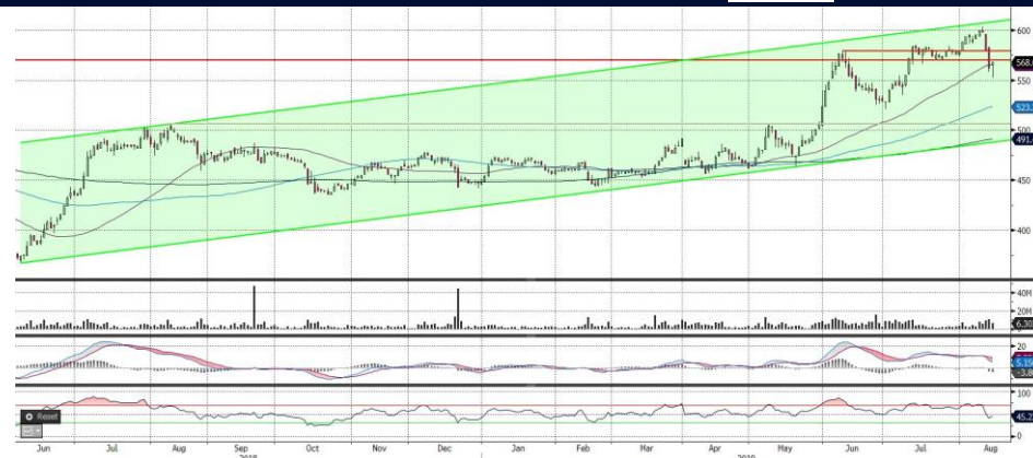
MOBILE TELECOMMUNICATIONS CO – DAILY CHART

The main trend remains. The Index, however, has created a double-top formation (a bearish reversal pattern). Expect weakness to unfold.