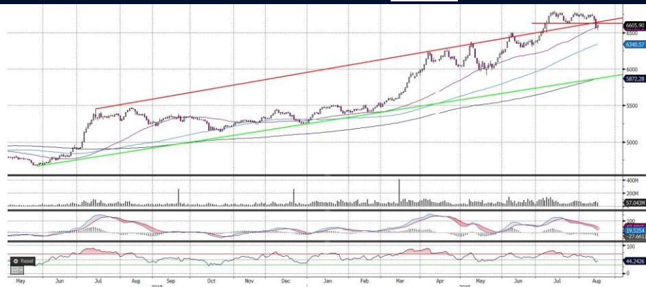
KWSE PREMIER MARKET – DAILY CHART