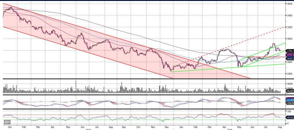
DFM GENERAL INDEX – DAILY CHART