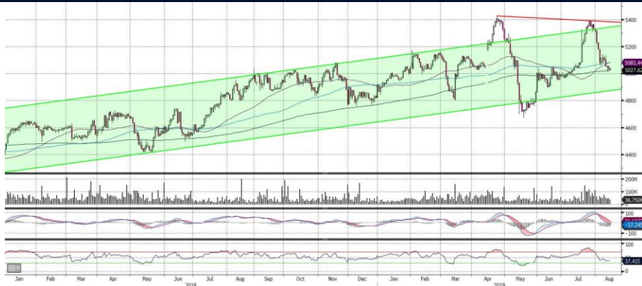
ADX GENERAL INDEX – DAILY CHART