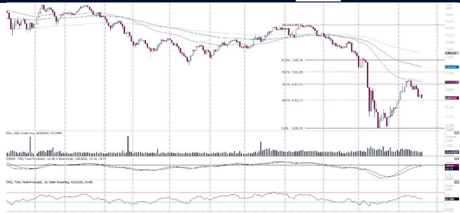
TADAWUL ALL-SHARE INDEX - DAILY CHART