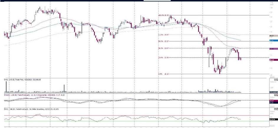
Bank Albilad - DAILY CHART

The Index reached the 50SMA, we may see weakness to unfold around here.