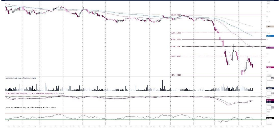
Abu Dhabi Commercial Bank - DAILY CHART

The Index reached the 50SMA, we may see weakness to unfold around here.