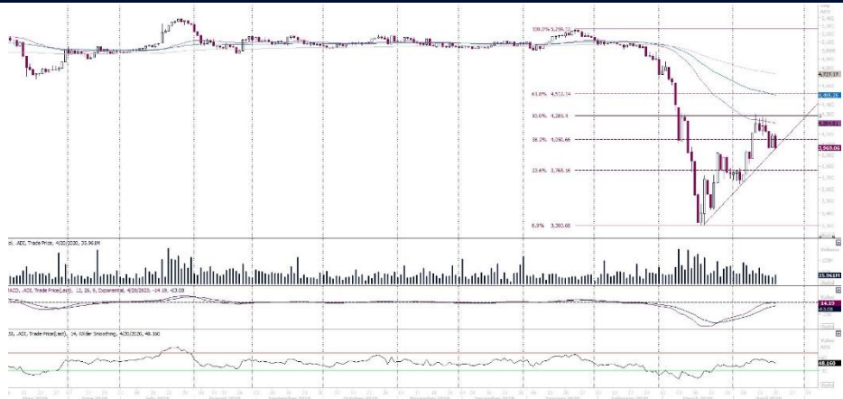
ADX GENERAL INDEX - DAILY CHART