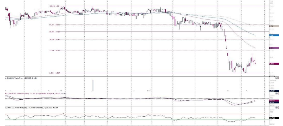
Shuaa Capital – DAILY CHART

The pressure remains down on the in the Index, beware of the bull-traps.