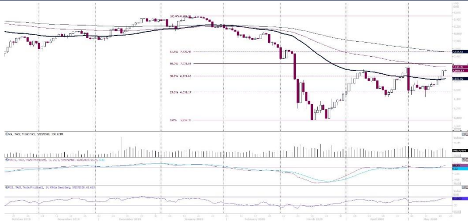
TADAWUL ALL-SHARE INDEX - DAILY CHART