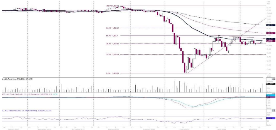
ADX GENERAL INDEX - DAILY CHART