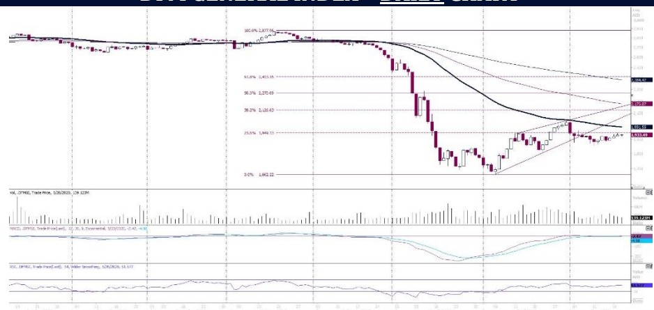
DFM GENERAL INDEX – DAILY CHART