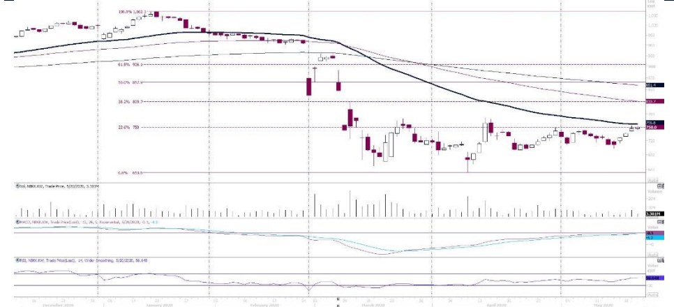
National Bank of Kuwait - DAILY CHART

The Index has created a bullish flag formation, suggesting the uptick could continue against the downtrend in the short term.