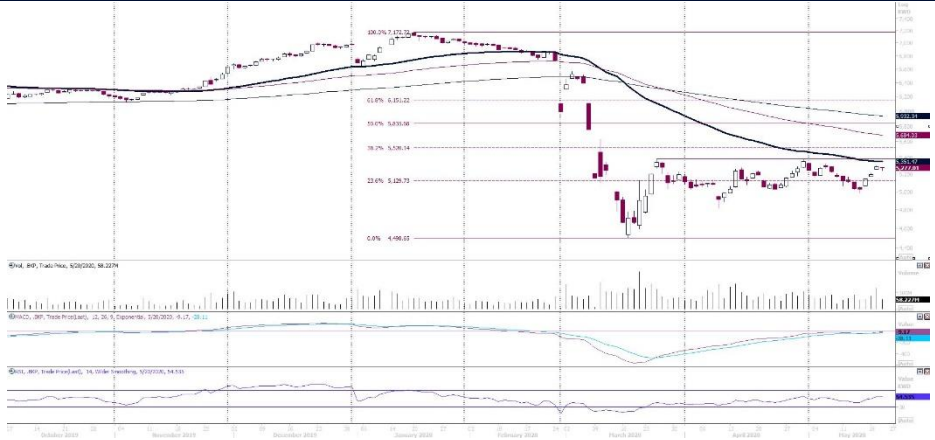
KWSE PREMIER MARKET - DAILY CHART