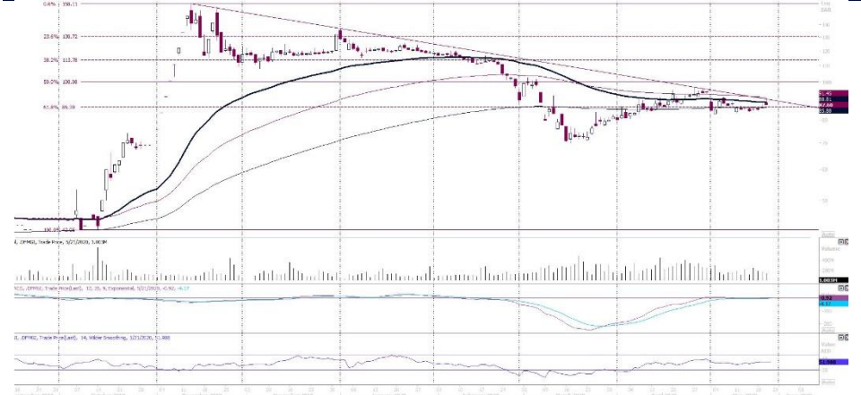
Al Kathiri Holding Co. - DAILY CHART

The Index failed to stay above the 50SMA and retreated under selling pressure.