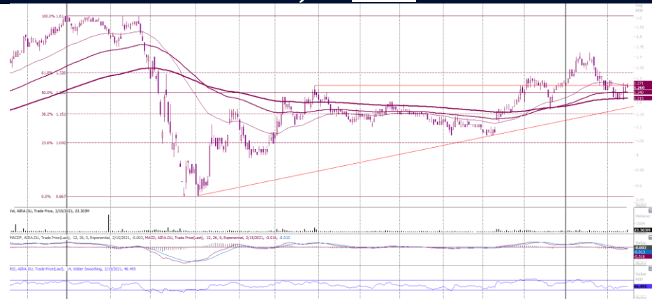
Air Arabia PJSC – DAILY CHART

The Index has been in a correction and is expected to weaken further in the short term.