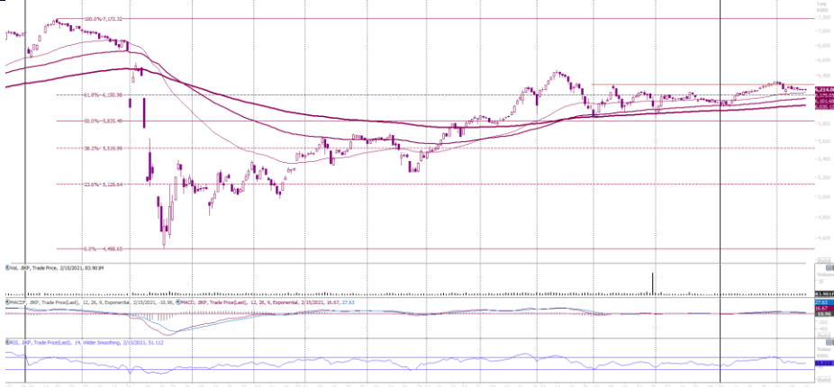
KWSE PREMIER MARKET - DAILY CHART