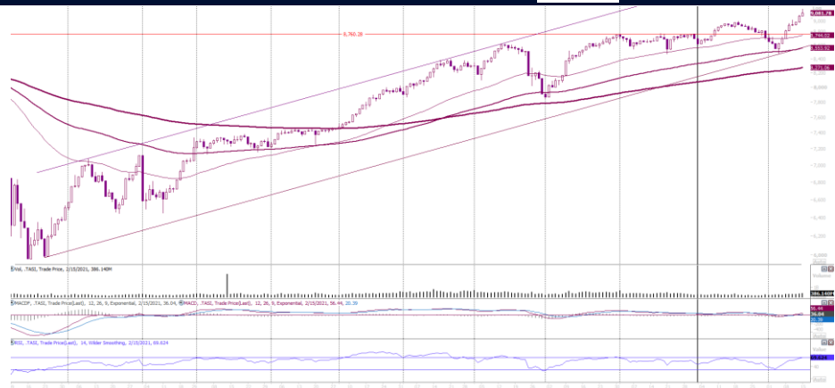
TADAWUL ALL-SHARE INDEX – DAILY CHART