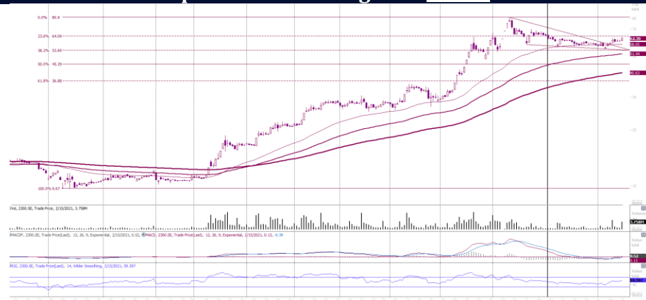
Saudi Paper Manufacturing Co. – DAILY CHART

The trend has been up and strong, and we expect this trend to continue despite volatility.