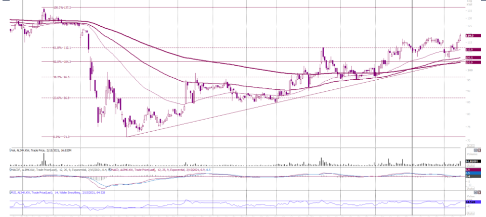
Alimtiq Investment Group Co - DAILY CHART

The Index is expected to move higher in the short term as it started to move above the range it created November of last year.