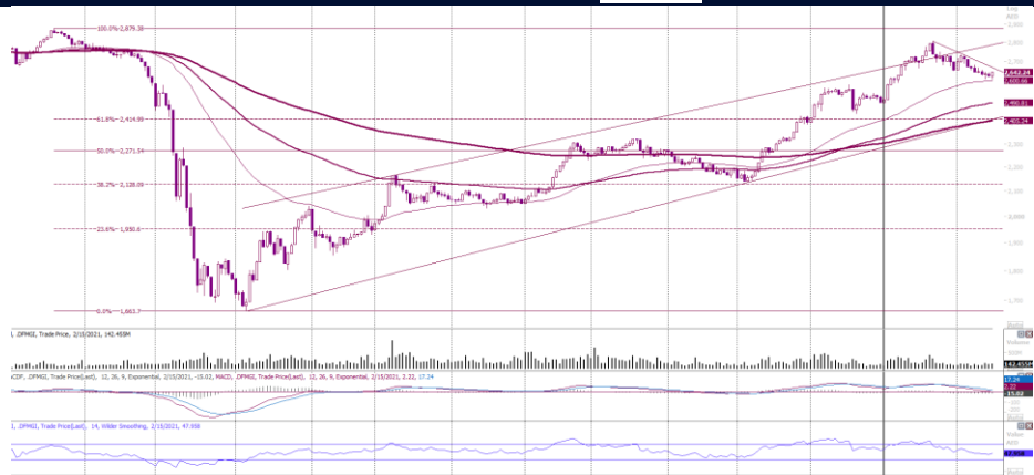
DFM GENERAL INDEX – DAILY CHART