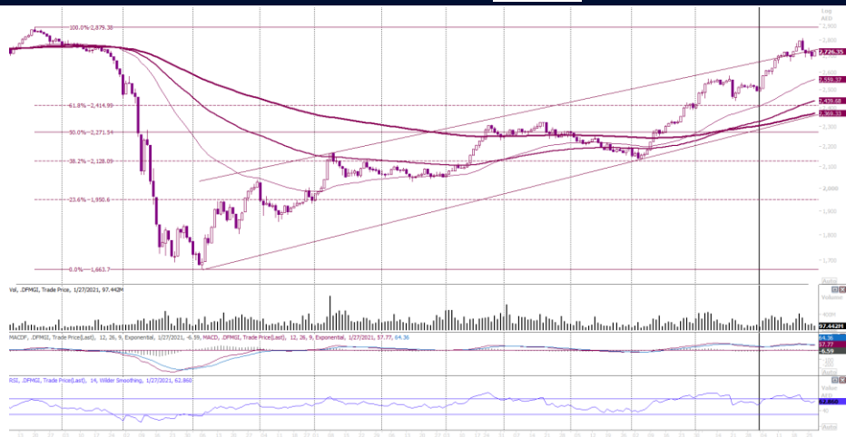
DFM GENERAL INDEX – DAILY CHART