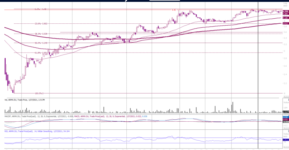
Aramex PJSC – DAILY CHART

The Index did not correct as we expected and remains with its uptrend. The RSI, however, remains to be negatively divergent against the price's movement. Thus, we should keep stops tight and use dips to capitalize on corrections.