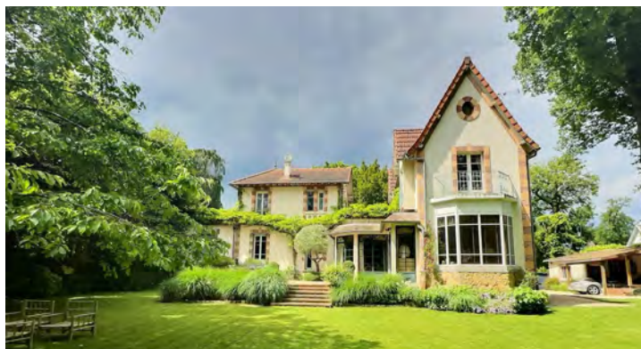
FRANCE - GARCHES - House of 362 m 2 with garden of 2000 m 2 . Reception rooms, equipped kitchen, 5 bedrooms. Family room, gym, wine cellar, laundry room. An independent garage/workshop complete this property. Ref: VER-12142-KD - Price: 3.300.000 €