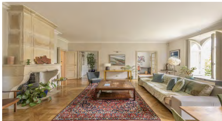
FRANCE - PARIS 7TH - SAINT-GERMAIN-DES-PRÉS - Exceptional 213 m 2 apartment on 4th floor with elevator in a luxury Townhouse. Large reception, 4 bedrooms, 4 bathrooms. Garden views. Rare. Ref: PRG-10442-NG - Price: 5.800.000 €

To explore these exciting global investment opportunities and QNB mortgage financing options, please call QNB First Customer Care Center at +974 4440 7788