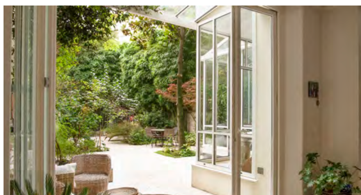
FRANCE - PARIS 17TH - LES TERNES - In a quiet street, elegant late 19th-century city mansion of 360 m 2 opening onto a 100 m 2 garden. 10 rooms, 6 bedrooms distributed over 3 levels by private elevator. Parking, utility room. Ref: PLM-10352-FH - Prix : 6.845.000 €