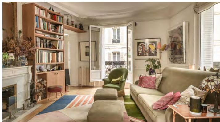
FRANCE - PARIS 9TH - NOUVELLE ATHÈNES - On the second floor of a beautiful freestone Haussmannian corner building, apartment of 126 m 2 with balcony. Living room, 3 bedrooms, 2 bathrooms. Cellar. Ref: PPR-10238-NG-CP - Price: 1.800.000 €